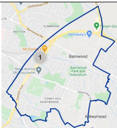
Area covered by Barnwood & Coney Hill Neighbourhood Policing Team

NOTE: Those attending are reminded that detailed crime figures are no longer presented at the HNPP meeting. Information on the current local Crime and Disorder figures (and your NPT ) can be accessed on at: https://www.gloucestershire.police.uk/area/your-area/gloucestershire/gloucester/